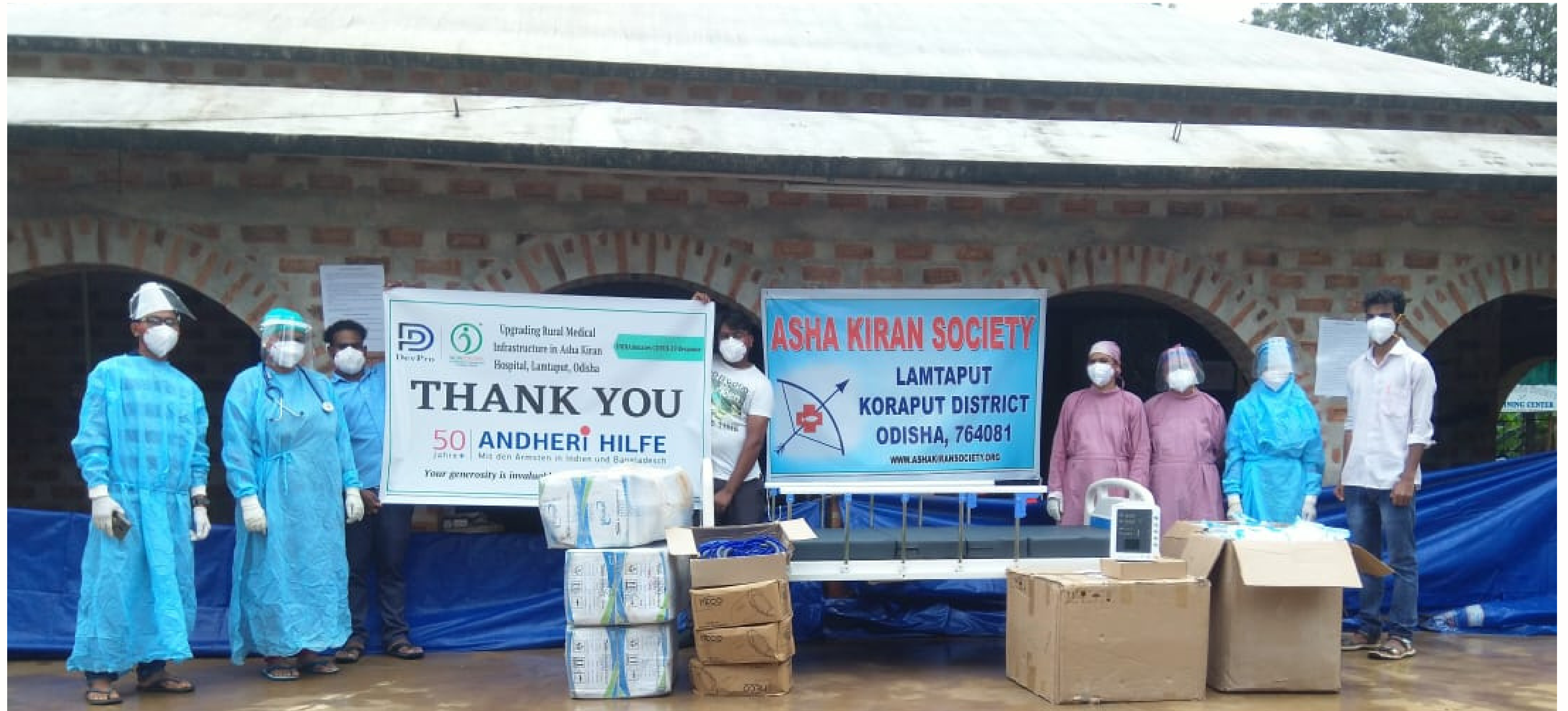
Asha Kiran Hospital, Lamtaput, Odisha