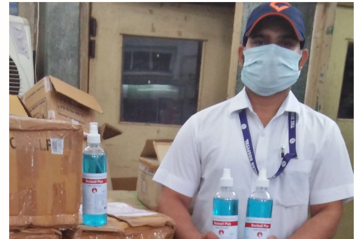
The Duncan Hospital, East Champaran, Bihar